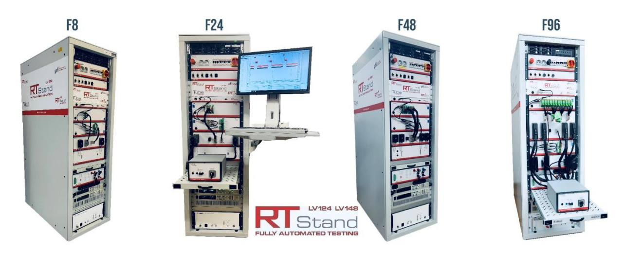
Figure 6. Various system layouts for LV124 / LV148 testing supporting up to 96 power lines and more than 14 CAN, LIN + 8 Automotive Ethernet 1000base-T1 / GMSL lines

Moreover, the software platform is being continuously maintained. Started years ago on a Windows 7 platform, it now supports Windows 11 and the newest software tools in the industry. One of the main focuses at WKS is to support the customers for as long as needed, and the yearly updates insure up to date norm libraries, software tools and operating system migrations.