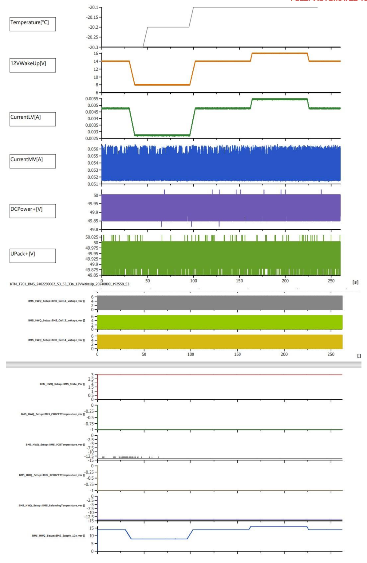
Figure 5. Customized PDF Report for LV124 / LV148 testing