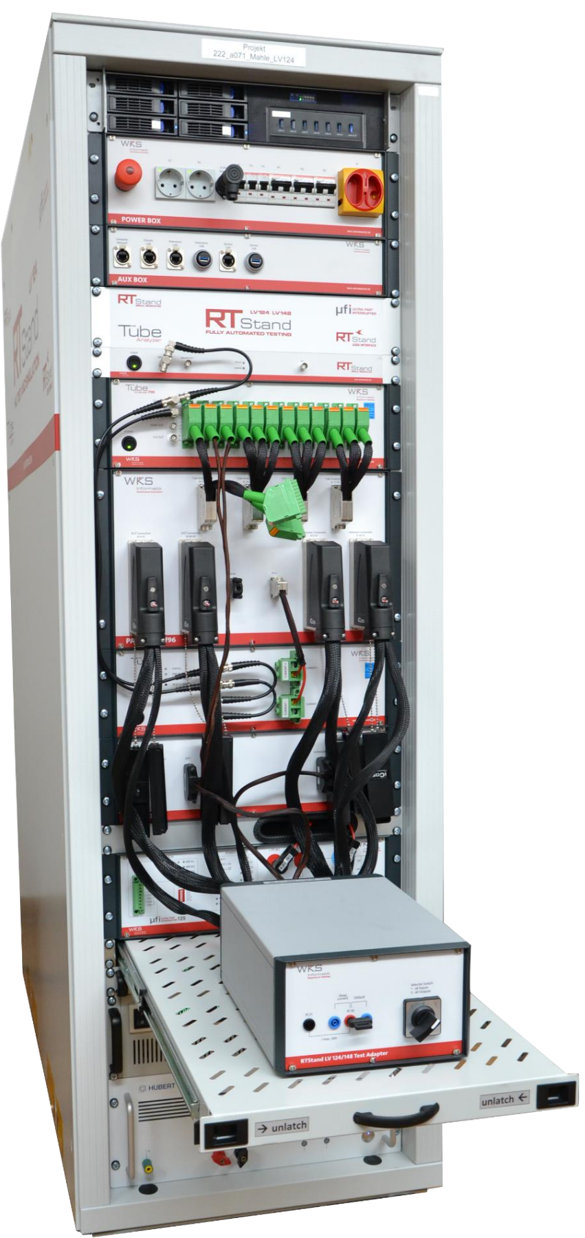
Figure 2. RTStand LV124 / LV148 fully automated testing system