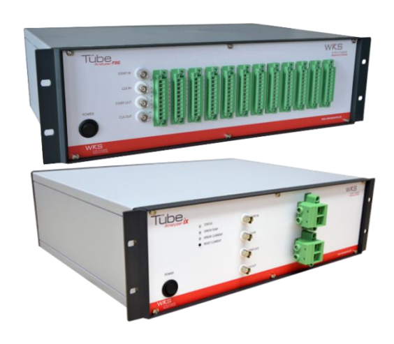
Figure 4. Key devices for LV124 / LV148 testing